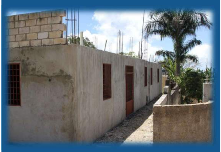
The Outpatient Clinic is still under construction, with Electrical & plumbing underway.

We pray the circumstances will encourage us to bring a near entire team, 15-20 volunteers ( Vs. 25-30, usually ) for our summer 2022 mission.