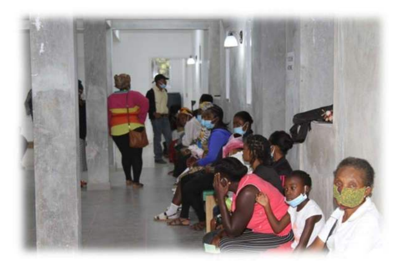
Patients waiting within our new spacious outpatient clinic

We also had the opportunity to assist two Interns doing their one-year-long Social Services in EKG, ultrasonography, etc., which was quite far from meeting our objectives.